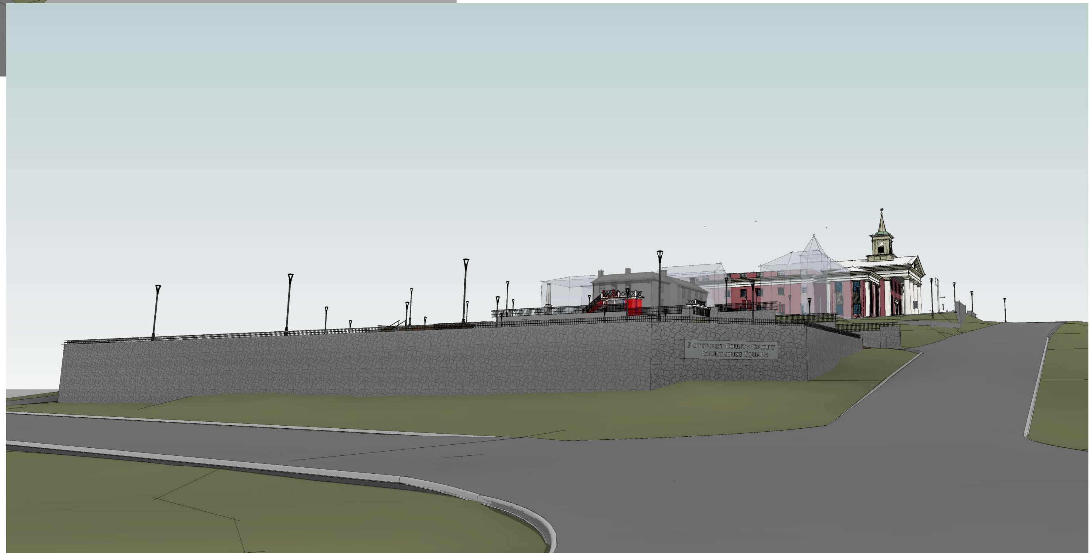
2 3D PERSPECTIVE - SW - RT 220 INTERSECTION SK0.03